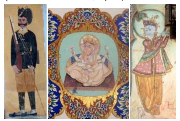
Fig.1, Three men in different forms

There are so many fresco paintings of different forms made in Jhunjhunu district. The artist paints men in three different forms, one paints a man with weapons, other paints man with elephant face and third one of a man with a stick or flute. Whoever sees them would call each of the fresco painting of a man. But how will it be known that these three are different from each other. Unless the artist has got the proper knowledge of the same, like, in first fresco, man is painted with weapon, looking like a bodyguard; in second a man looks like a Ganesha because of an elephant trunk and man with flute just portrays the character of Krishna.