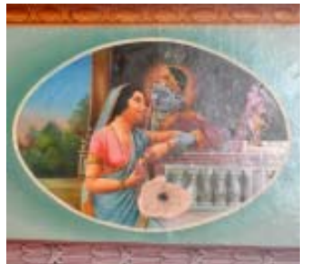
Fig.IV. Krishna meeting with Radha

Like in Jhunjhunu frescoes of leela-majnu , dhola-maru , rasa-leela , etc having modifications of natural feelings under the influence of special circumstances reflect in the facial expressions and facial expressions betray the altered state of body as a whole. For example rasa-leela is one of the best known frescoes, is on the domed ceiling. The rasa-leela is a round dance in which Krishna divides into many images so that every gopi in love with him is able to have him as a companion.