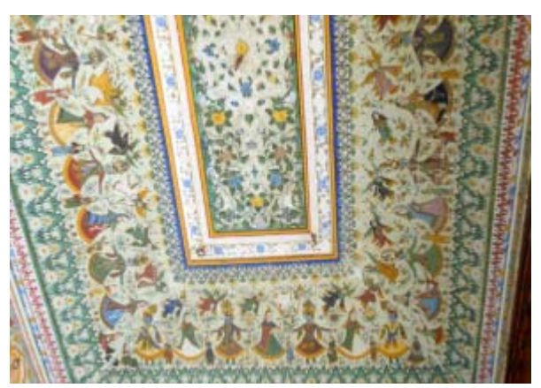
Fig.III, Fresco on rasa-leela

Bhava is the representation of sentimental grace in posture and is the action of feeling of form. When an observer is confronted with a painting, something happens inside him that makes react to the painting in either a favorable or indifferent manner. This initial impetus which makes his consciousness to convey the idea, sentiment, emotion, intention that he set out to do. Expression conveyed through form is Bhava .