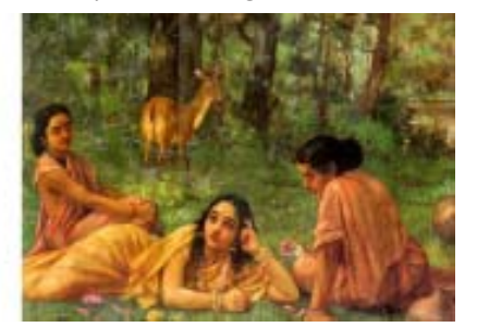
Fig. IX, Fresco\ on\ Shakuntala Fig. X, Oleograph\ on\ Shakuntala