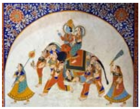
Fig.VIII,Fresco on Nava-nari-kunjara ,Nawalgarh