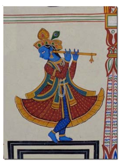
Fig .XI,Flutrist Krishna

Use of colour scheme in the fresco painting in an artistic way is Varnika-Bhanga . There should be appropriate colour scheme to express ideas and atmosphere in the painting related to subject matters. Opposite or wrong colour should not be used otherwise sense of painting will change. For this artists should have knowledge about the colour scheme concerning subject matters. Like in the fresco( fig.XI ), Artist Achal SinghShekhawat paintedKrishna's body is in blue and yellow with red dhoti is shown.Blue represents the sky, a symbol of space (infinite); yellow represents the earth, a symbol of the finite. Together, blue and yellow represent union of infinite (heavenly) and the finite (earthly) realms. Krishna reconciles heaven and earth; a universal symbol of the axis mundi that which binds heaven, earth and man. Varinka-Bhanga placed in the last limb of